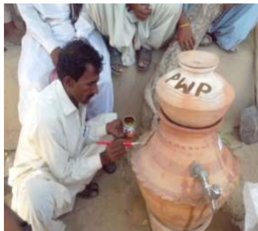
Image 1. Demonstration of bio sand water filter in Basti Barach

An adaptation of the traditional slow sand filter better suited to household water treatment, the bio sand filter (BSF), can be constructed usually locally with available material (pitchers, PVC pipe, tape & graded filter) in a low-cost manner (under $10 per filter). The filter can be used intermittently and removes pathogens from drinking water. As a secondary benefit, the BSF can also reduce turbidity, bad odour, and taste from water, in addition to removing iron, manganese, and arsenic (Cawst 2009). Due to non-availability of laboratory equipment in the remote village areas, testing could not be carried out at the sites to accurately measure efficiency.