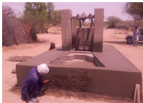
Image 3. Well restoration in progress

PWP identified and restored damaged wells in continuation of WACREP activities in different villages where natural depressions existed. A common complaint in brackish water zones of Tharparkar is that there are no provisions for recharging wells with fresh rainwater. In order to utilize rainwater to improve water quality and raise the water table in the wells, small catchment ponds were dug with gravel, stone, and sand filtration.