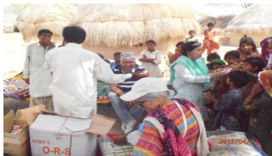
Image 7. Distribution of medicines among community members

Prolonged periods of drought exacerbated the poor health of community dwellers in Tharparkar. PWP distributed first aid medicines among local communities of 21 villages.