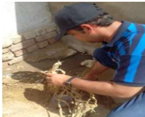
Image 6. Demonstration of sowing Hybrid Napier

Residents of the district were mostly underfed due to chronic food shortage. Therefore, to augment food security, PWP distributed over 15-20 kg of vegetable seeds packets per village to address malnutrition, improve women's household income and to promote kitchen gardening techniques by utilizing kitchen residue water. This intervention raised the resilience of the communities and increased their food security. Only salt tolerant and drought-resisting varieties of vegetable seeds were distributed in 23 villages. Villagers were advised to build garden plots near household kitchens.