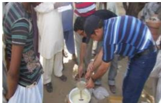
Image 4. Demonstration of Soap Making Methods in Basti Barach

This activity has gained acceptance in many areas of Tharparkar and communities claim that household costs for soap reduced significantly from Rs. 1500 to Rs. 280, registering a 5x reduction in cost for procuring soap from the market for washing and bathing each month . Such savings were highly appreciated by communities where this activity was demonstrated. Several families in Mithi reported that after this activity they started to make their own soap and no longer relied on markets for their daily use of detergents and body soap.