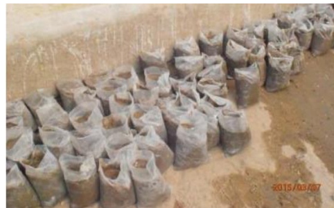
Image 8. Plants for village nurseries

The seeds were provided free of cost. Forest nurseries were completed with the technical assistance of Mithi's Forest Department. The PWP team was also briefed about rangeland issues, like land degradation due to overgrazing, prolonged drought and use of deep aquifer water.